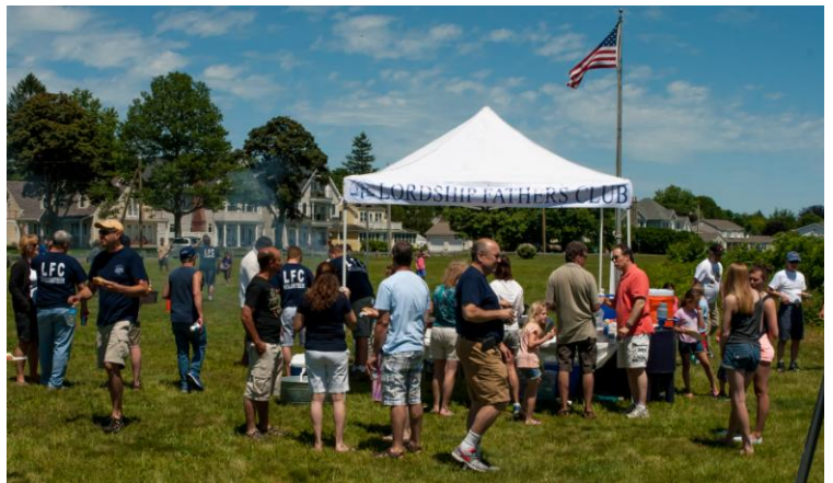
2014 LFC SUMMER BEACH PICNIC