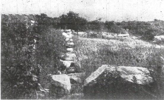
This depression may be the remains of the legendary "Minto" or "Mills" tunnel. Ruins of the great Stratford Point warehouse of the Mills, "Minto" and Nichols families. These great stones may have supported a tunnel two centuries ago. 1936.

There have been many stories of Captain William Kidd burying treasure in Lordship between 1698 and 1699. People have searched for his treasure on Lordship's Long Beach (now Pleasure Beach). Point-No-Point (the Seawall) and at Stratford Point. The largest occurred in 1855. The Spiritualists of Bridgeport, Huntington, and Stratford, gathered a hundred or more strong, and dug for thirty days in search of Captain Kidd's gold. The excavation covered several acres in area, and was still visible almost 100 years later. A medium of some note pointed out the locality as the true one, and great faith was placed in her ability to discover hidden treasures. The restriction was placed upon the company that, while they searched, no one should speak above a whisper. This stipulation was rigidly adhered to until the thirtieth day, when one of the party struck another accidentally on the foot with a shovel. The pain was so great that the injured man uttered a terrible oath and the spell was broken. Then all departed silently to their homes, firmly believing that they had been very near to the coveted money. One of the areas that they dug is shown in a 1936 photo at the land on 1005 Prospect Drive. Prospect Drive is named for the prospectors who took the dirt road out to the Point to dig. While digging here in ruins from what legend has was a smuggling warehouse, they discovered tunnels which continually filled with water.